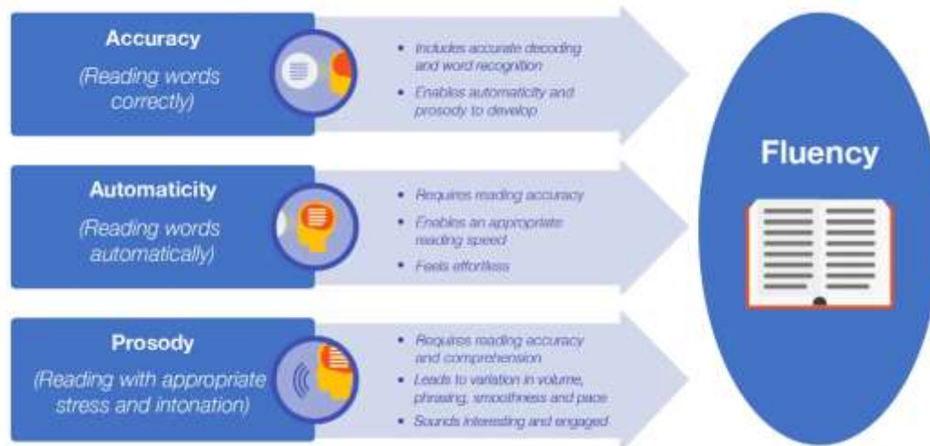
Figure 5: Reading fluency

Reading skills are developed through daily whole class reading sessions in KS2. These run as 30 minute sessions, 5 times a week. The sessions include texts from our Reading Spine, which have been chosen specifically for reading sessions. Across a half term, children will access a variety of text types, including Fiction, Non-Fiction and Poetry. Every child reads aloud daily in their reading lessons, where we develop fluency through accuracy and automaticity (using punctuation, echo, and choral readings) and prosody using ACT (Adjust our volume, Change our tone, Think about our pace and when to pause).